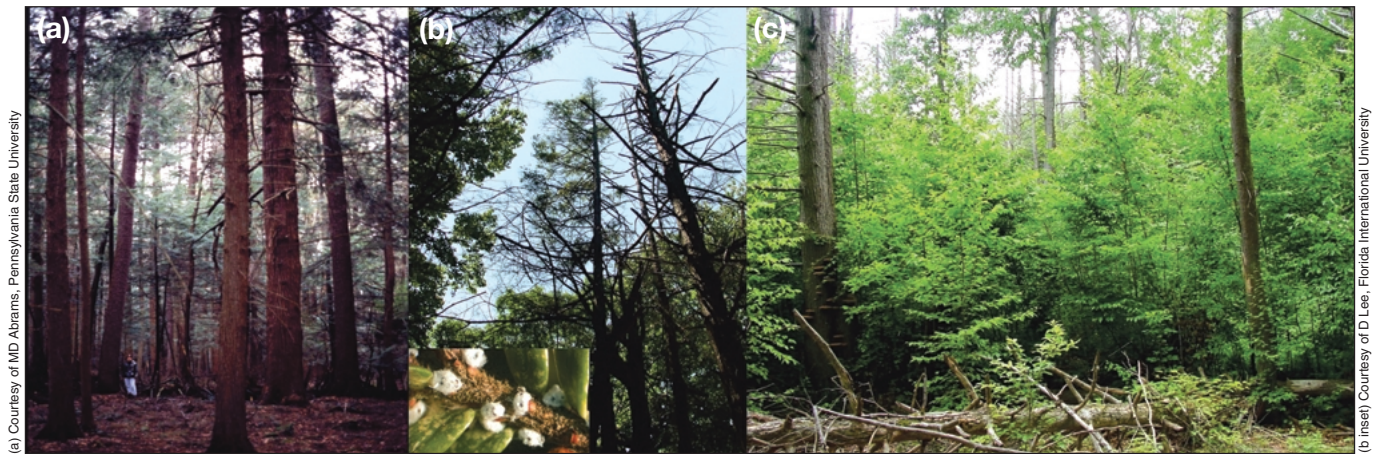
Figure 1. (a) An old-growth eastern hemlock ( Tsuga canadensis ) stand, (b and inset) a stand declining following 10 years of infestation by the introduced hemlock woolly adelgid ( Adelges tsugae ), and (c) dense regeneration of black birch ( Betula lenta ) saplings on a site formerly dominated by eastern hemlock in southern Connecticut. Nearly all hemlock trees in this 150-hectare forest in southern Connecticut were killed in the mid-1990s by hemlock woolly adelgid.

cal makeup contribute substantially to ecosystem processes. Foundation tree species are declining throughout the world due to a number of factors, including introductions and outbreaks of nonindigenous pests and pathogens, irruptions of native pests, over-harvesting and high-intensity forestry, and deliberate removal of individual species from forests. We use three examples from North America to illustrate consequences for both terrestrial and aquatic habitats of the loss of foundation tree species: the ongoing decline of eastern hemlock ( Tsuga