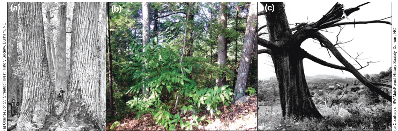
Figure 4. American chestnut. (a) Chestnut timber, Great Smoky Mountains of western North Carolina (circa 1910), a foundation species that was transformed in the mid-20th century to an understory shrub (b; small shrub in center) by the introduced pathogen Cryphonectria parasitica , which causes chestnut blight (c; chestnut in the Blue Ridge Plateau killed by the blight, circa 1946).

stream macroinvertebrates have life cycles closely synchronized to the dynamics of detrital decay, and this change in detrital quality undoubtedly affected the macroinvertebrate assemblage, although there are no data to support this supposition. Furthermore, slowly decomposing chestnut wood persists for decades in stream channels, altering channel structure and providing habitat for fish and invertebrates. For example, in an Appalachian headwater stream sampled in the late 1990s, Wallace et al. (2001) found that 24% of the large (> 10 cm diameter) woody debris still consisted of American chestnut that had died over 50 years earlier.